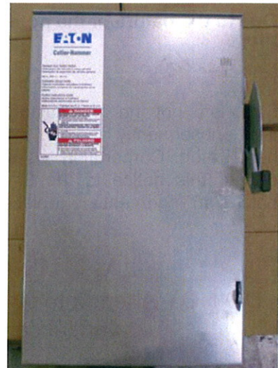
Figure 1: 60A General Duty "B" Series Safety Switch

In order to remedy this potential condition, Eaton Corporation will provide you with a replacement switch at no cost.