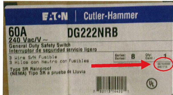
Figure 2: The red circle indicates where the package label date code is located.