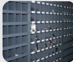
(Before and After Photos)